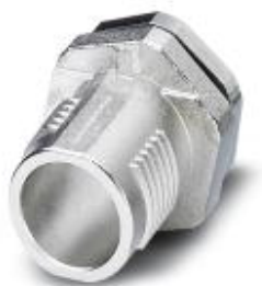
M12 SPEEDCON housing screw connection for M12 male inserts, with O-ring, for all SPEEDCON-capable THR and wave soldering contact carriers

Please be informed that the data shown in this PDF Document is generated from our Online Catalog. Please find the complete data in the user's documentation. Our General Terms of Use for Downloads are valid ( http://phoenixcontact.com/download )