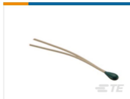
TE Part #GA30K6A11A DISCRETE 30K OHMS,+/-0.1C FROM 0C TO 70C