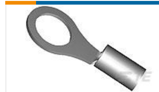
TE Part #322798 SOLIS R HR 22-16COM 22-18MIL 8