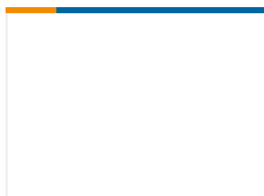
TE Part #CTJ122E02D-4010 MODULE ASSY