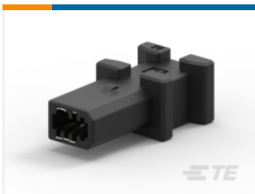
TE Part #1971153-1 CONN ASSY INDUSTRIAL MINI I/O