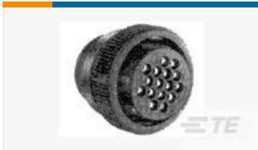
TE Part #206060-1 CPC PLUG ASSEMBLY SIZE 11-4