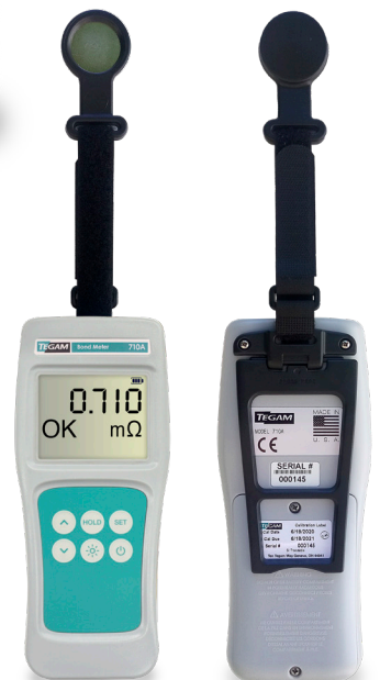
Tilt Stand/Magnet/ Carrying Strap