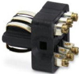
HEAVYCON spring insert, STAF series, 6-pos., screw connection without wire protection

Please be informed that the data shown in this PDF Document is generated from our Online Catalog. Please find the complete data in the user's documentation. Our General Terms of Use for Downloads are valid ( http://phoenixcontact.com/download )