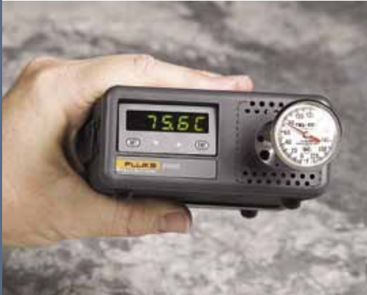
Temperature sensor calibration is easy with a handheld dry-well.