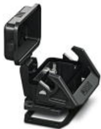
HEAVYCON EVO panel mounting base, plastic, B10, with single locking latch, height: 30.5 mm, with flat gasket, with protective cover

Please be informed that the data shown in this PDF Document is generated from our Online Catalog. Please find the complete data in the user's documentation. Our General Terms of Use for Downloads are valid ( http://phoenixcontact.com/download )