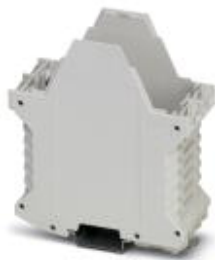
DIN rail housing, Lower housing part with metal foot catch, tall design, with vents, width: 45.2 mm, cross connection: DIN rail connector (optional), number of positions cross connector: 5, color: light gray (7035)

Please be informed that the data shown in this PDF Document is generated from our Online Catalog. Please find the complete data in the user's documentation. Our General Terms of Use for Downloads are valid ( http://phoenixcontact.com/download )