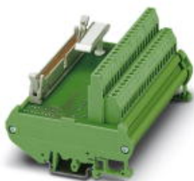
VARIOFACE interface module for 32 channels

Please be informed that the data shown in this PDF Document is generated from our Online Catalog. Please find the complete data in the user's documentation. Our General Terms of Use for Downloads are valid ( http://phoenixcontact.com/download )