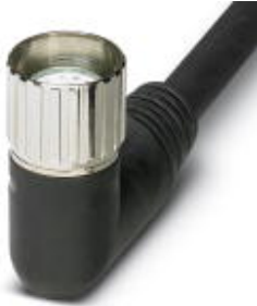
Socket M23, 19-pos., angled, shielded, with shielded, connected master cable, length: 25 m

Please be informed that the data shown in this PDF Document is generated from our Online Catalog. Please find the complete data in the user's documentation. Our General Terms of Use for Downloads are valid ( http://phoenixcontact.com/download )