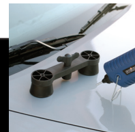
Paintless Dent Removal