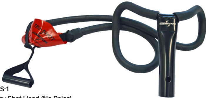
TS-1 Tru Shot Head (No Poles)