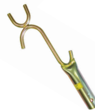
WR-1 Limb Raiser

Conveniently pulls or lifts branches out of dense foliage. No adapter needed. Snaps into pole ferrule. Not for use on or near live wires.