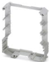
Complete housing, length: 99 mm, Central part, color: light gray, width: 45 mm

Please be informed that the data shown in this PDF Document is generated from our Online Catalog. Please find the complete data in the user's documentation. Our General Terms of Use for Downloads are valid ( http://phoenixcontact.com/download )