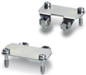
Adapter insert, type: D25

Please be informed that the data shown in this PDF Document is generated from our Online Catalog. Please find the complete data in the user's documentation. Our General Terms of Use for Downloads are valid ( http://phoenixcontact.com/download )