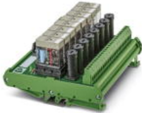
VARIOFACE 8-channel pluggable relay module, 1PDT

Please be informed that the data shown in this PDF Document is generated from our Online Catalog. Please find the complete data in the user's documentation. Our General Terms of Use for Downloads are valid ( http://phoenixcontact.com/download )