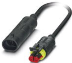
Sensor/actuator cable, 2-position, PUR halogen-free, black-gray RAL 7021, Plug straight Superseal Clip locking, on Socket straight Superseal Clip locking, cable length: 1.5 m

Please be informed that the data shown in this PDF Document is generated from our Online Catalog. Please find the complete data in the user's documentation. Our General Terms of Use for Downloads are valid ( http://phoenixcontact.com/download )