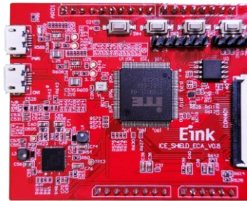
Figure 1 ICE Shield top view