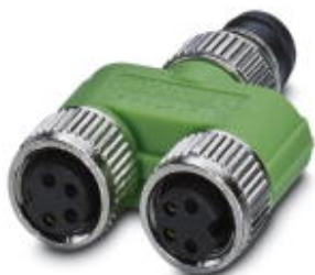
Y distributor, 4-position, unshielded, Plug straight M8, A-coded, on Socket straight M8, A-coded and Socket straight M8, A-coded, Parallel distributor

Please be informed that the data shown in this PDF Document is generated from our Online Catalog. Please find the complete data in the user's documentation. Our General Terms of Use for Downloads are valid ( http://phoenixcontact.com/download )