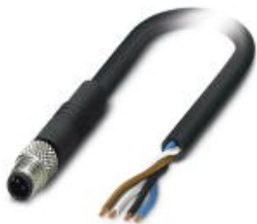
Sensor/actuator cable, 4-position, PUR, black RAL 9005, Plug straight M5, A-coded, on free cable end, cable length: 1.5 m

Please be informed that the data shown in this PDF Document is generated from our Online Catalog. Please find the complete data in the user's documentation. Our General Terms of Use for Downloads are valid ( http://phoenixcontact.com/download )