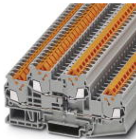
Component terminal block, with integrated diode, connection method: Quick connection, cross section: 0.25 mm 2 - 1.5 mm 2 , AWG: 24 - 16, width: 5.2 mm, color: gray, mounting type: NS 35/7,5, NS 35/15

Please be informed that the data shown in this PDF Document is generated from our Online Catalog. Please find the complete data in the user's documentation. Our General Terms of Use for Downloads are valid ( http://phoenixcontact.com/download )