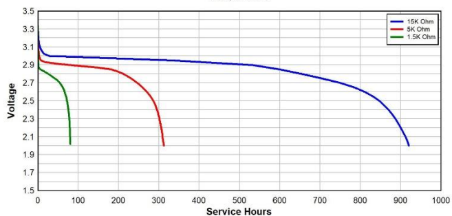
Continuous Discharge Multiple Loads