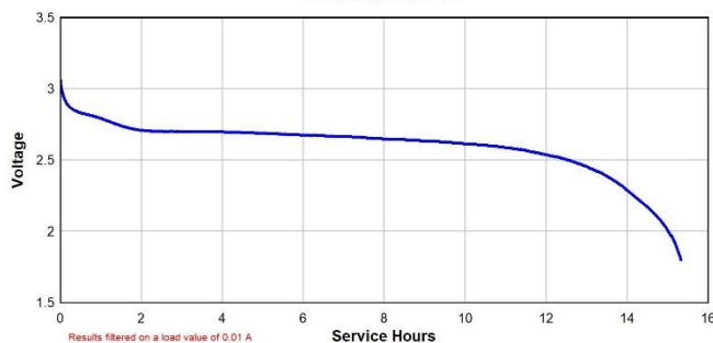
IEC Key Fob Performance 10 mA 5s/m, 24hd to 1.8V