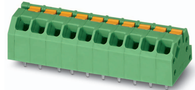
The figure shows 10-pos. standard item (without EX marking)

PCB terminal block, Push-in spring connection