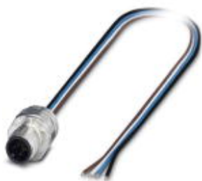
Sensor/actuator flush-type plug, 4-pos., M12 SPEEDCON, A-coded, front/screw mounting with M16 thread, can be positioned, with 0.5 m TPE litz wire, 4 x 0.34 mm 2

Please be informed that the data shown in this PDF Document is generated from our Online Catalog. Please find the complete data in the user's documentation. Our General Terms of Use for Downloads are valid ( http://phoenixcontact.com/download )