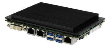
IB899 with Heatsink