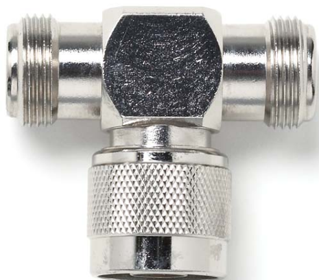
Model 73044 N Type "T" Jack-Plug-Jack Adapter