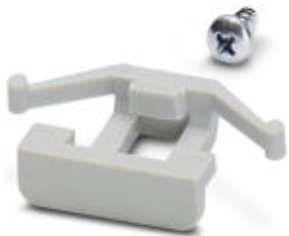
Press-drawn section housings, Base latch, color: gray

Please be informed that the data shown in this PDF Document is generated from our Online Catalog. Please find the complete data in the user's documentation. Our General Terms of Use for Downloads are valid ( http://phoenixcontact.com/download )