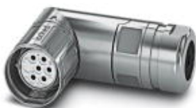
The figure shows the 6-pos. product version

Cable connector, angled, shielded: yes, SPEEDCON locking, M23, No. of pos.: 7, type of contact: Socket, Crimp connection, cable diameter range: 6 mm ... 10 mm