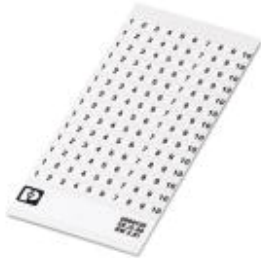
Marker cards, white, Mounting type: Adhesive, For terminal block width: 3.81 mm

Please be informed that the data shown in this PDF Document is generated from our Online Catalog. Please find the complete data in the user's documentation. Our General Terms of Use for Downloads are valid ( http://download.phoenixcontact.com )