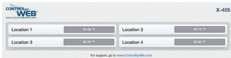
Example Control Page