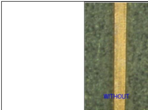
EXISTING PIN WITHOUT COIN

CUSTOMER CAN SEE WHAT APPEARS TO BE A SCRIBE LINE DOWN THE LENGTH OF THE TAIL ON ONE SIDE