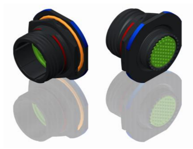
LAYOUT SHOWN AS EXAMPLE