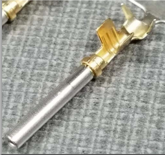
Size 20 Socket (Before)