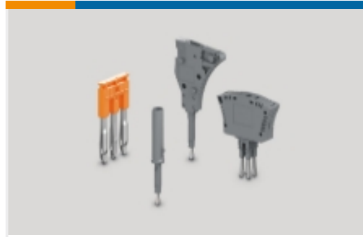
Terminal Block & Strip Conducting Accessories(67)