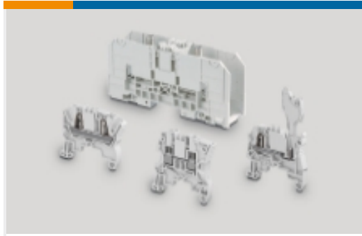
Modular Terminal Blocks(320)