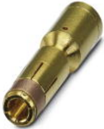
Crimp contact, turned, contact diameter: 3.6 mm, crimp range: 2.5 mm 2 ... 4 mm 2

Please be informed that the data shown in this PDF Document is generated from our Online Catalog. Please find the complete data in the user's documentation. Our General Terms of Use for Downloads are valid ( http://phoenixcontact.com/download )