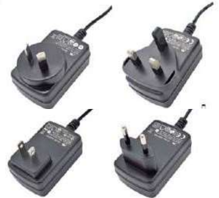
*Product images are for illustrative purposes only and may vary from actual design.