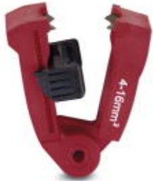
Replacement blade for WIREFOX 16, for cables and conductors of 4 - 16 mm 2

Please be informed that the data shown in this PDF Document is generated from our Online Catalog. Please find the complete data in the user's documentation. Our General Terms of Use for Downloads are valid ( http://phoenixcontact.com/download )