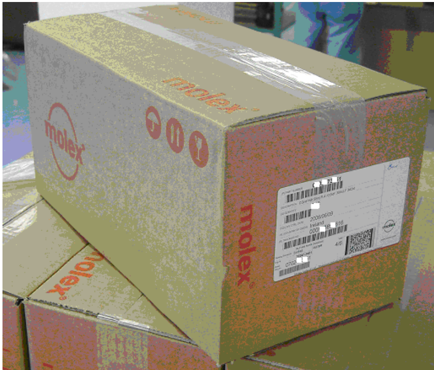
Figure 2: Box packed and labeled.

A Standard Molex Label is placed on Carton as shown in Figure 2.