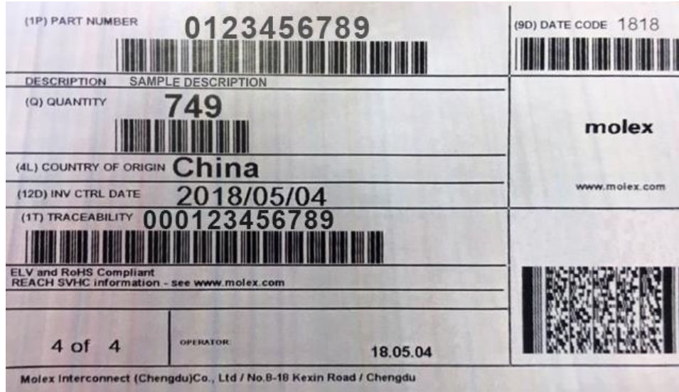
Figure 4: Generic Molex Label, Part Numbers, Quantities and Description Will Vary

A label is placed on each reel and on each carton, see Figure 4 below for an example of a label. The carton label measures 120 mm x 76.2 mm.