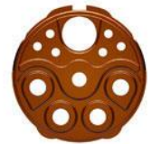
Contact Arrangement mating view