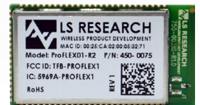
Actual size (23 mm x 41.4 mm)