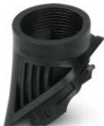
Plastic thread adapter, for HEAVYCON EVO housing, NPT 1/1" thread

Please be informed that the data shown in this PDF Document is generated from our Online Catalog. Please find the complete data in the user's documentation. Our General Terms of Use for Downloads are valid ( http://phoenixcontact.com/download )