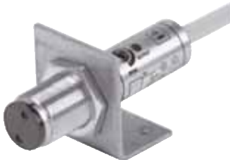
Sensor fitted inside the mounting aid

Using the mounting aid cylindrical sensors are fast and easy to fit. Use the nuts included with the sensor for attachment.