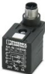
Valve connectors, 5-position, Plug straight M12 SPEEDCON, A-coded, on Valve connector AD (pressure switch), with 2 LEDs

Please be informed that the data shown in this PDF Document is generated from our Online Catalog. Please find the complete data in the user's documentation. Our General Terms of Use for Downloads are valid ( http://phoenixcontact.com/download )