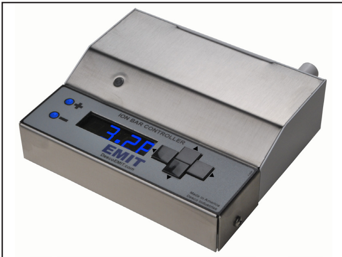
Figure 1. EMIT Pulsed Ion Bar Controller