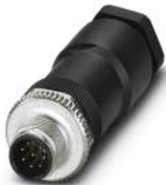
Connector, 8-position, Plug straight M12, A-coded, Screw connection, knurl material: Zinc die-cast, nickel-plated, cable gland Pg11, external cable diameter 8 mm ... 10 mm

Please be informed that the data shown in this PDF Document is generated from our Online Catalog. Please find the complete data in the user's documentation. Our General Terms of Use for Downloads are valid ( http://phoenixcontact.com/download )