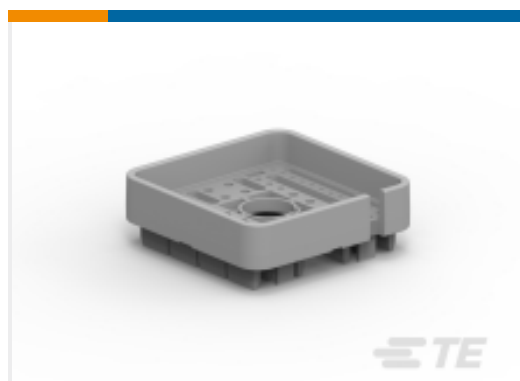
TE Part #WB-48SB DEUTSCH DRB Wedgelocks