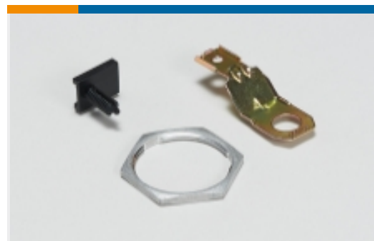
Other Automotive Connector Accessories(6)