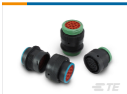
TE Part #HDP26-24-21PE DEUTSCH HDP20 Housings