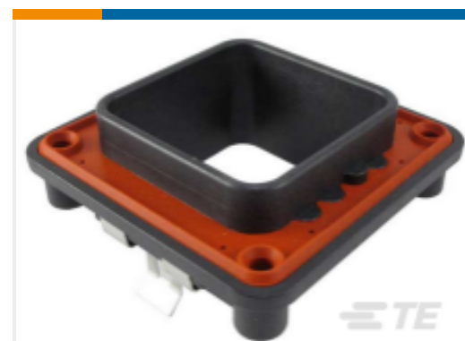
TE Part #DRBF-2B FLANGE, MOUNT, 60/48P, BLK, B