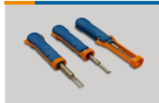
Insertion & Extraction Tools(1)