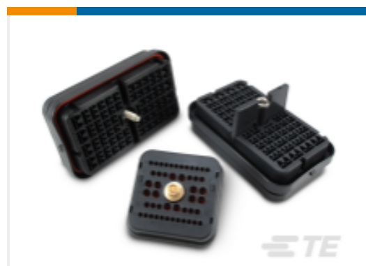
TE Part #DRB16-48SBE-L018 DEUTSCH DRB Housings