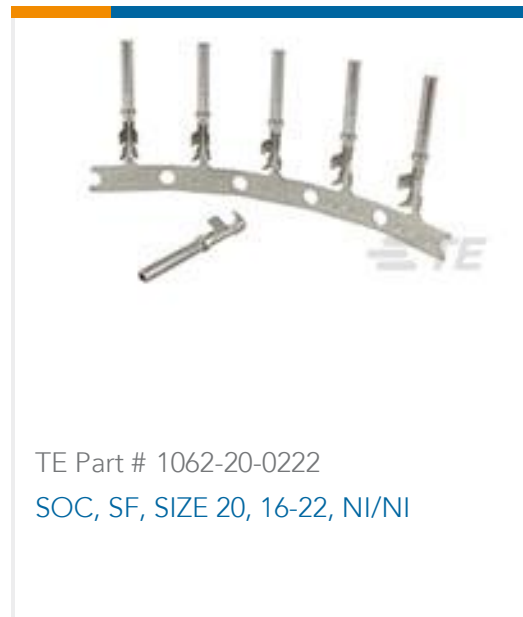
TE Part # 1062-20-0222 SOC, SF, SIZE 20, 16-22, NI/NI