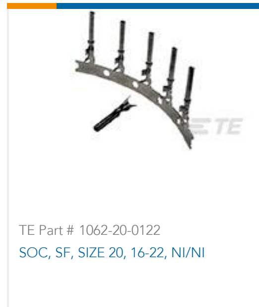
TE Part # 1062-20-0122 SOC, SF, SIZE 20, 16-22, NI/NI