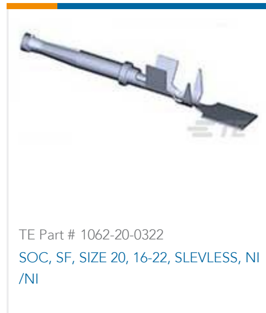
TE Part # 1062-20-0322 SOC, SF, SIZE 20, 16-22, SLEVELESS, NI/NI