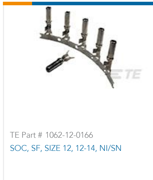
TE Part # 1062-12-0166 SOC, SF, SIZE 12, 12-14, NI/SN