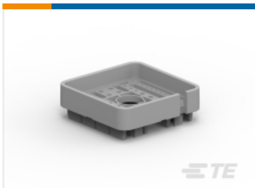
TE Part #WB-48SB DEUTSCH DRB Wedgelocks