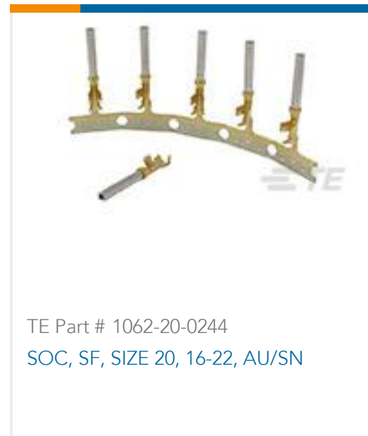
TE Part # 1062-20-0244 SOC, SF, SIZE 20, 16-22, AU/SN