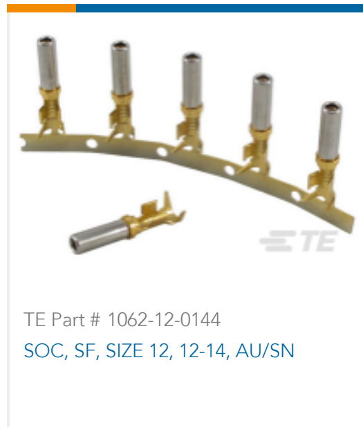
TE Part # 1062-12-0144 SOC, SF, SIZE 12, 12-14, AU/SN