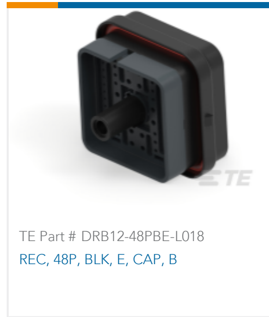
TE Part # DRB12-48PBE-L018 REC, 48P, BLK, E, CAP, B