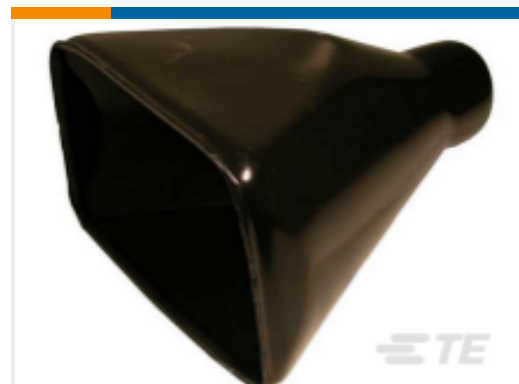
TE Part #DRB102-BT BOOT, 102P, PLG/REC, ST, BLK