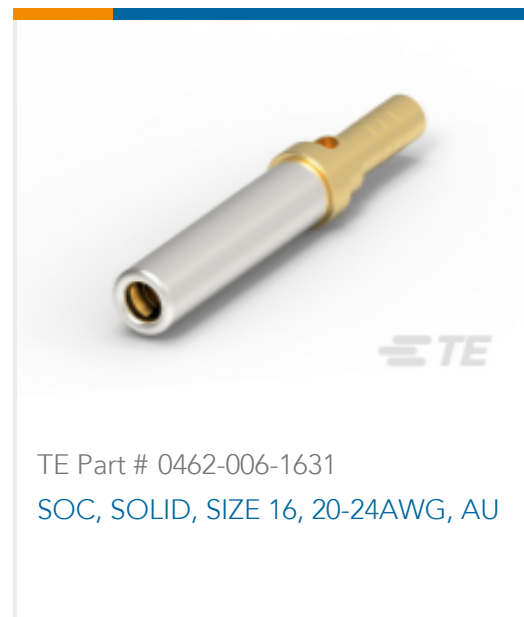
TE Part # 0462-006-1631 SOC, SOLID, SIZE 16, 20-24AWG, AU