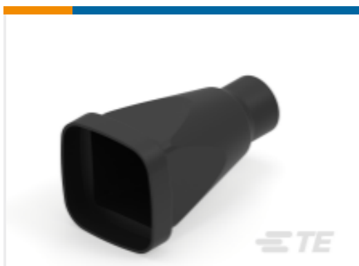
TE Part #DRB48-60-BT BOOT, 48/60P, PLG/REC, ST, BLK