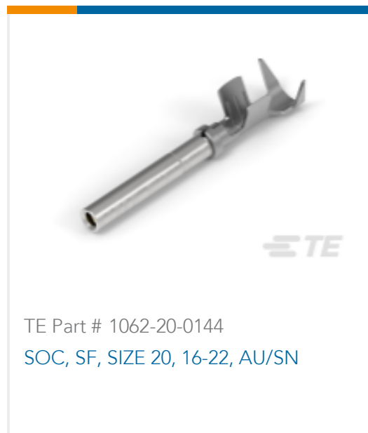
TE Part # 1062-20-0144 SOC, SF, SIZE 20, 16-22, AU/SN