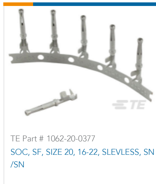
TE Part # 1062-20-0377 SOC, SF, SIZE 20, 16-22, SLEVELESS, SN/SN