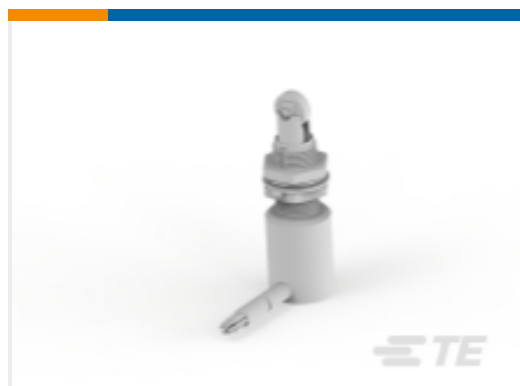
TE Part #K1138370 Limit switch G12-211-M-15 904