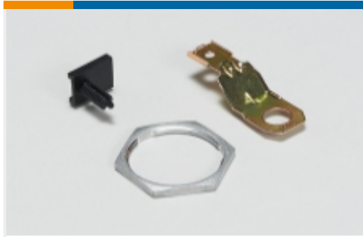
Other Automotive Connector Accessories(6)