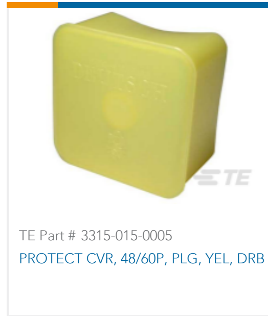
TE Part # 3315-015-0005 PROTECT CVR, 48/60P, PLG, YEL, DRB