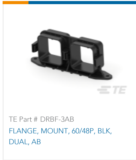
TE Part # DRBF-3AB FLANGE, MOUNT, 60/48P, BLK, DUAL, AB