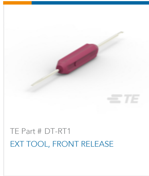
TE Part # DT-RT1 EXT TOOL, FRONT RELEASE