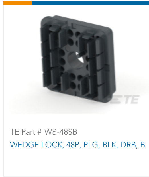
TE Part # WB-48SB WEDGE LOCK, 48P, PLG, BLK, DRB, B