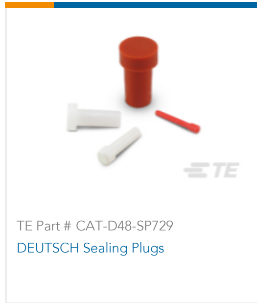
TE Part # CAT-D48-SP729 DEUTSCH Sealing Plugs