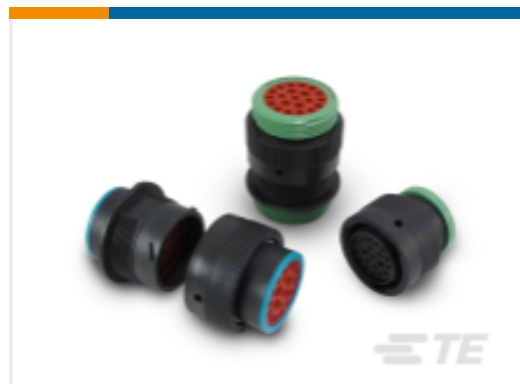
TE Part #HDP26-24-9SE-L015 DEUTSCH HDP20 Housings