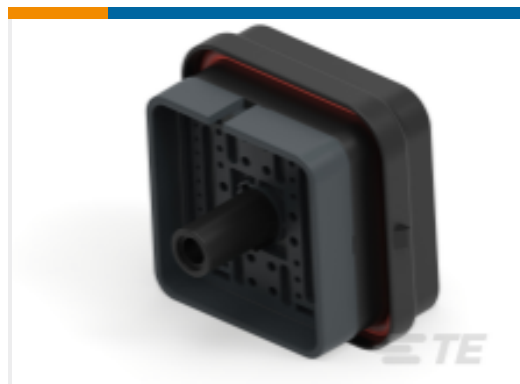
TE Part #DRB12-48PBE-L018 REC, 48P, BLK, E, CAP, B