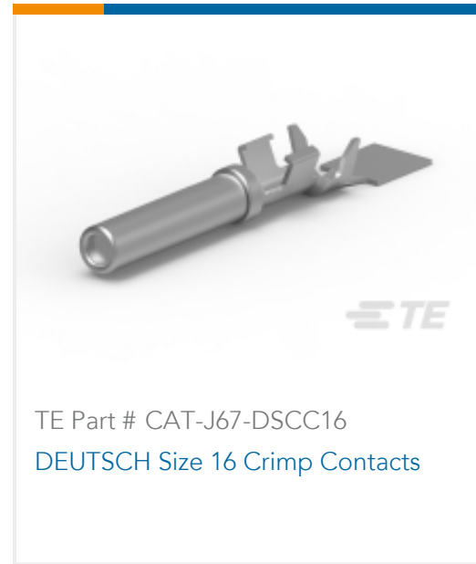
TE Part # CAT-J67-DSCC16 DEUTSCH Size 16 Crimp Contacts