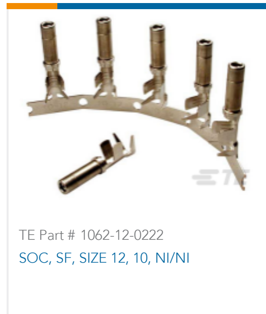
TE Part # 1062-12-0222 SOC, SF, SIZE 12, 10, NI/NI