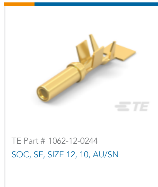
TE Part # 1062-12-0244 SOC, SF, SIZE 12, 10, AU/SN