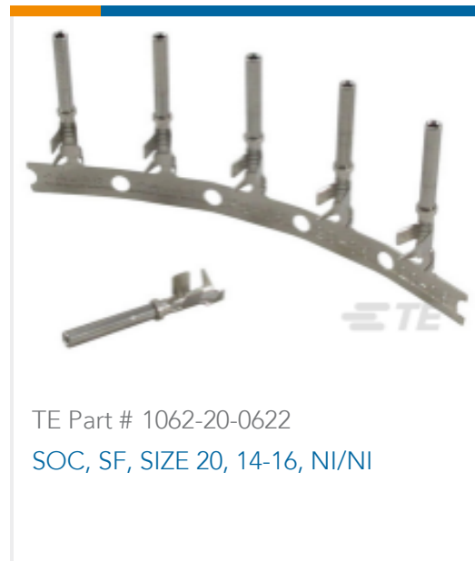
TE Part # 1062-20-0622 SOC, SF, SIZE 20, 14-16, NI/NI