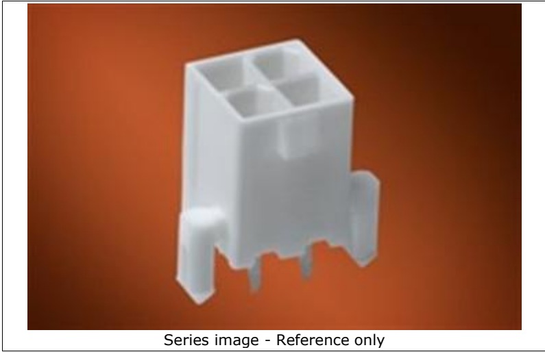
Series image - Reference only