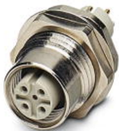
Sensor/Actuator flush-type socket, 5-pos., M12, A-coded, rear/screw mounting with Pg9 thread, with straight solder connection

Please be informed that the data shown in this PDF Document is generated from our Online Catalog. Please find the complete data in the user's documentation. Our General Terms of Use for Downloads are valid ( http://phoenixcontact.com/download )