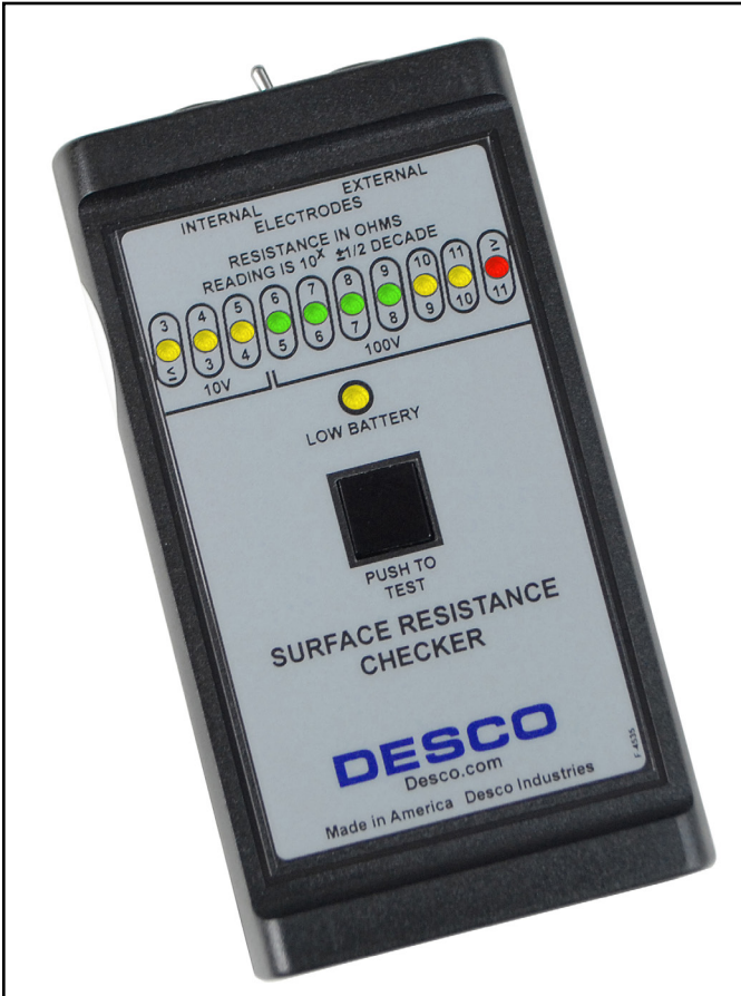
Figure 1. Desco 19640 Surface Resistance Checker