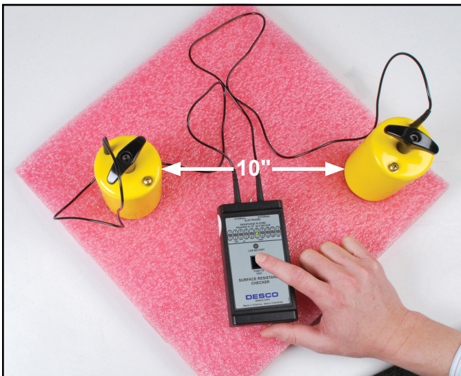
Figure 4. Using the 19641 test leads and 50003 five-pound electrodes to measure Rtt

Clean the material's surface for test lab measurements, but do not clean the surface for materials that are already installed. Only clean and re-test the installed material if failure occurs.