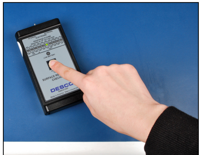
Figure 3. Using the parallel electrodes to measure surface resistance

If the measurement is outside acceptable limits, clean the surface with an ESD cleaner containing no insulative silicone such as Desco 10435 Reztore® Surface & Mat Cleaner, and re-test to determine if the cause of failure is an insulative dirt layer or the ESD worksurface material.