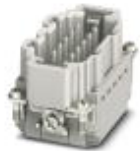
HEAVYCON pin insert, B10 series, 10 + PE-pos., push-in connection

Contact insert - HC-B10-I-PT-M - 1407730