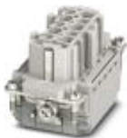
HEAVYCON socket insert, B10 series, 10 + PE-pos., push-in connection

Contact insert - HC-B10-I-PT-F - 1407729