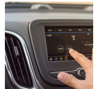
Audio Display Equipment